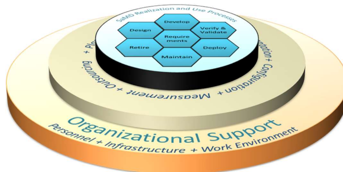
Figure 2: Relationship between Quality Management Principles

The concepts presented in this section relate to clauses 4 and 5 in ISO 13485:2003.